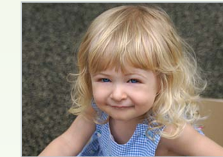
Children played outside on the playground while mothers received soothing Spa Treatments inside.

Baby Bungalow, a family resource center of the Child Abuse Council, was recently transformed into a day spa where over 50 mothers indulged in a day of spa services and relaxation as Council staff provided free babysitting.